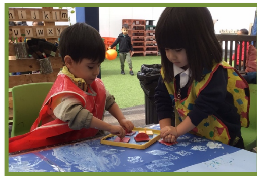
It is lovely to see the Nursery children using art activities to build friendships with their new friends.