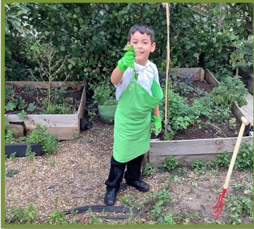
Gardening Club is well underway already this school year. Parents and children are welcome to join if interested.